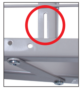
Patent Pending Rail Slots

Specifications are subject to change without notice.