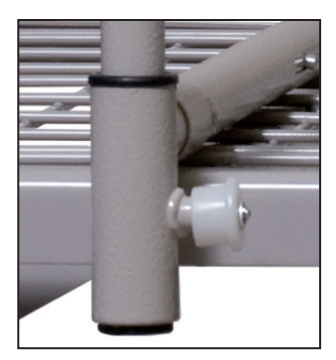
Crossbrace Safety Tab